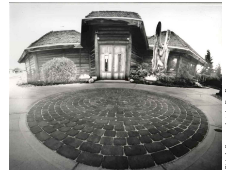
Pinhole Camera

DEADLINE FOR SUBMISSIONS AUGUST 31, 2009